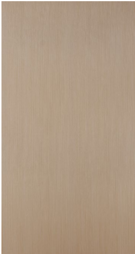
Rift White Oak FL-Q-4-394