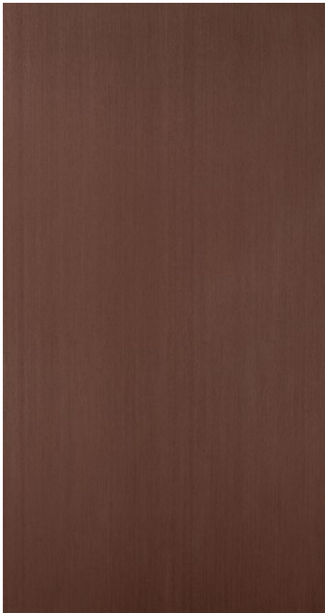
Wenge Java FL-Q-2-957