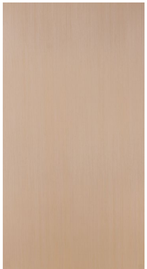
Quartered Maple FL-Q-1-166