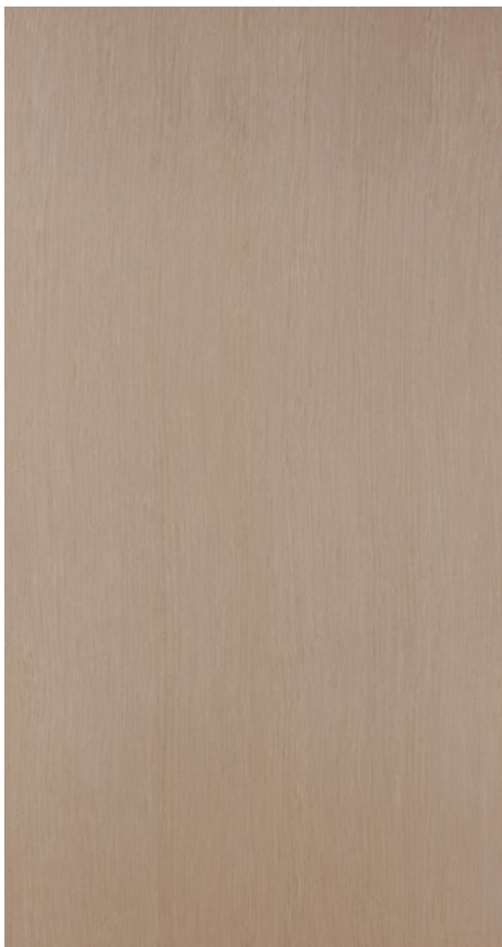
Rift Wheat Oak FL-Q-3-175