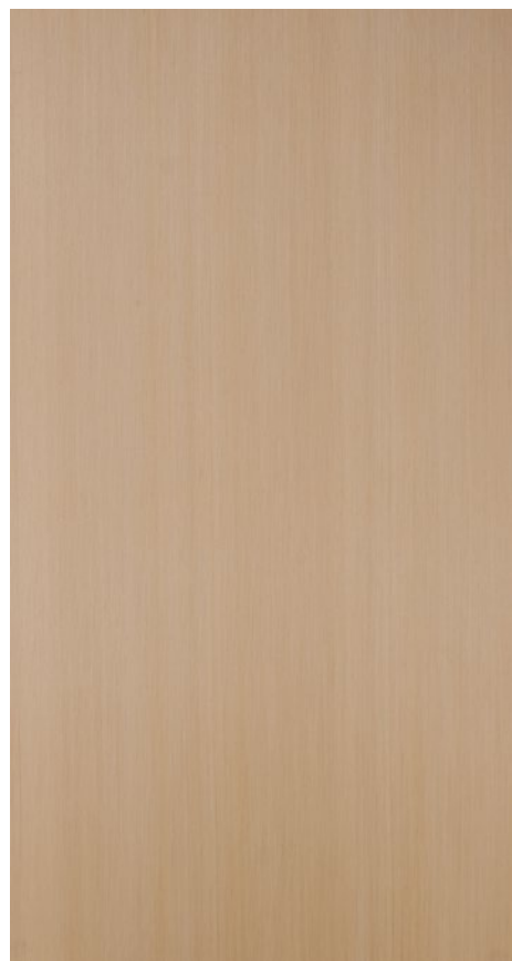
VG Fir FL-Q-1-304