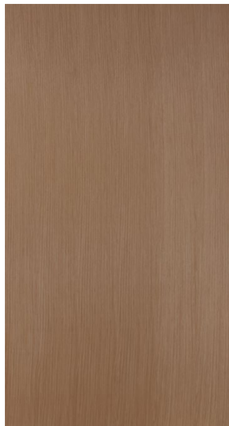
Rift Red Oak FL-Q-4-648