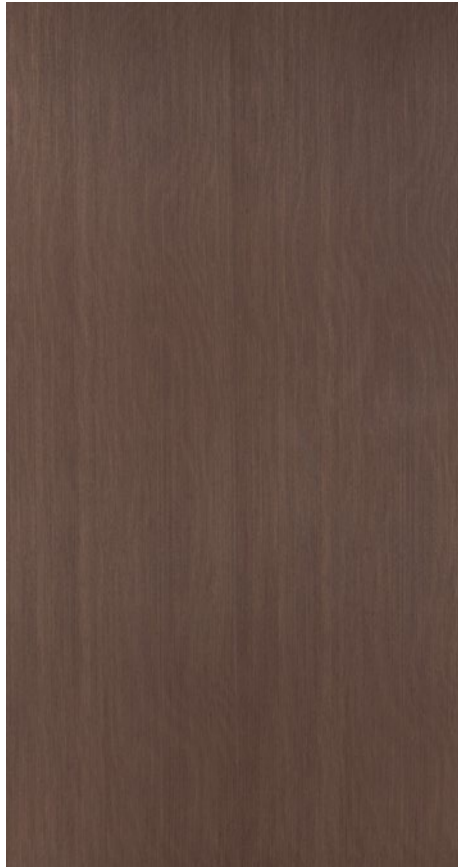
Quartered Wenge FL-Q-4-956