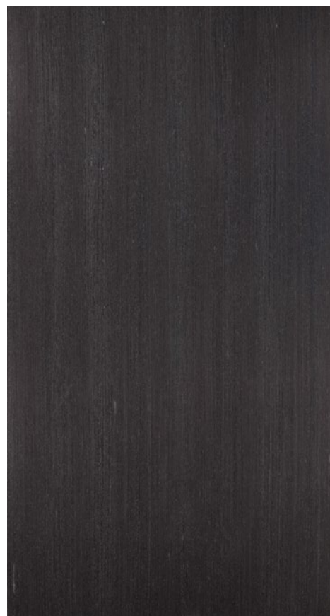
Sirius Black FL-Q-5-907