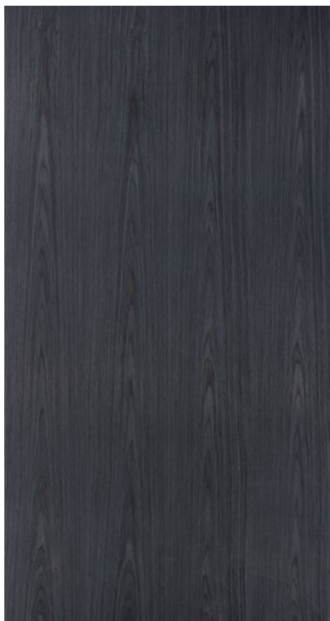
Flat Cut Black Ebony FL-F-5-902-C