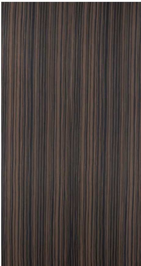
Quartered Silver Ebony FL-Q-4-902