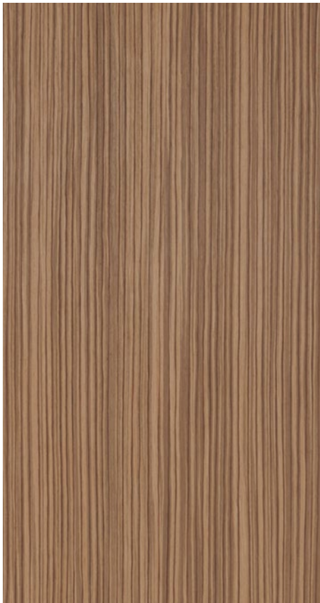
Quartered Zebrano FL-Q-3-682