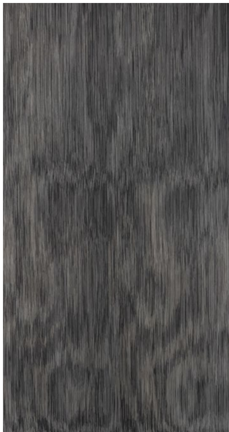
Stratus Gray FL-Q-6-269