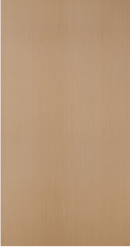
Western Fir FL-Q-1-316