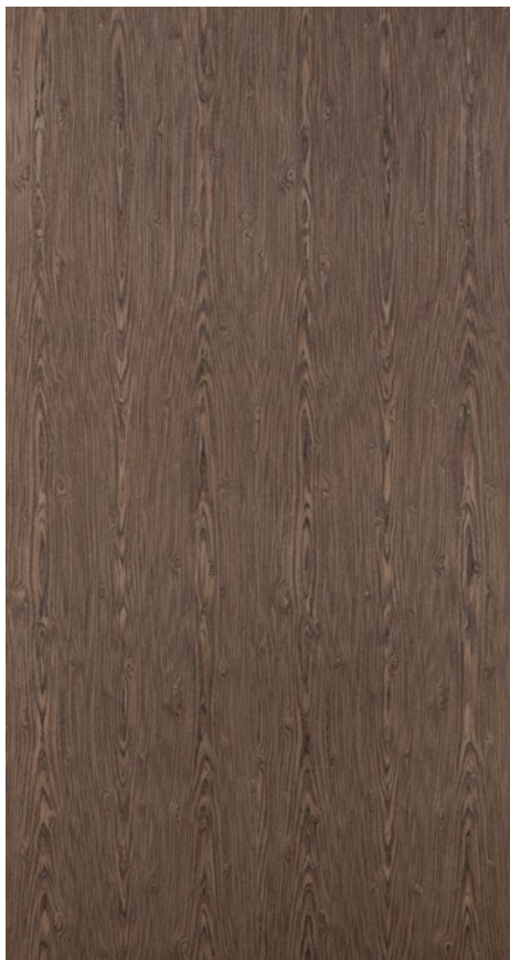
Flat Cut Chocolate Oak FL-F-5-214