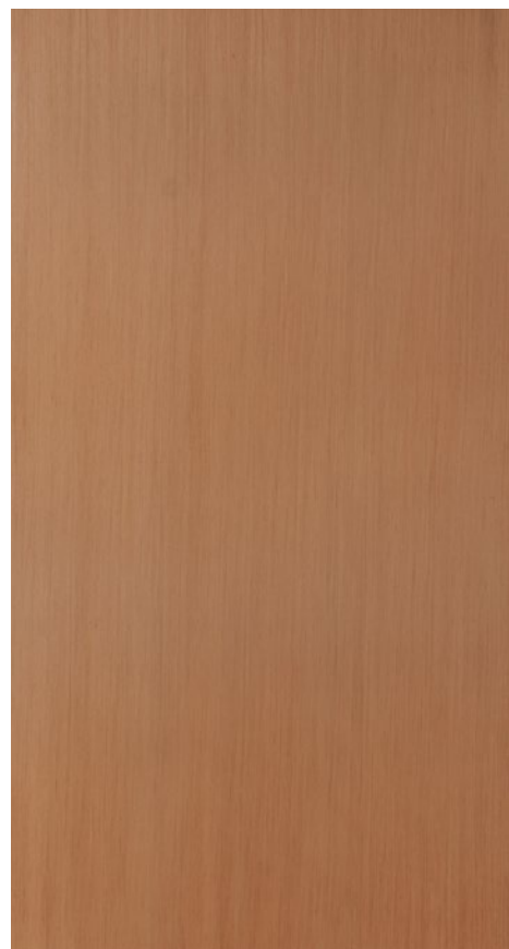
Quartered Cherry FL-Q-3-595