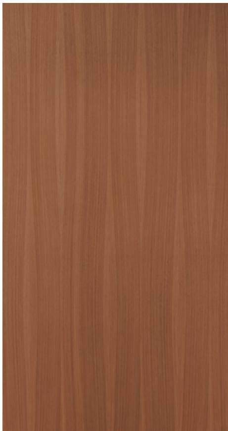
Quartered Golden Teak FL-Q-1-639