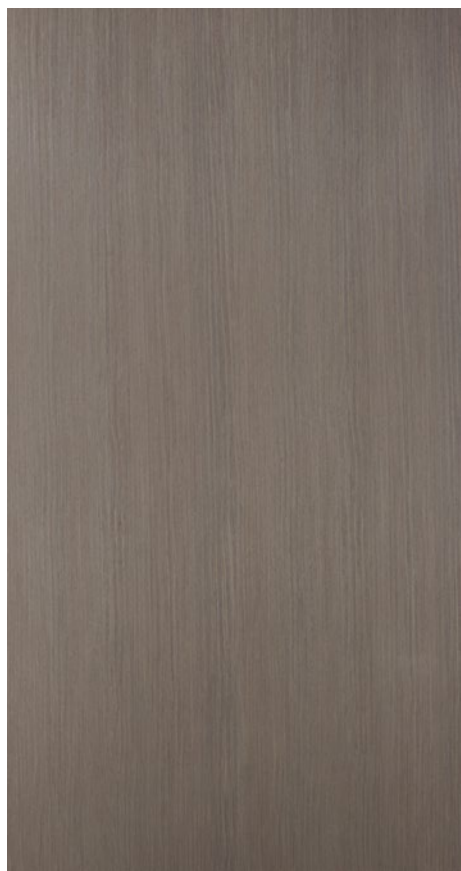
Rift Greige FL-Q-7-216