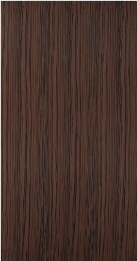
Quartered Macassar Ebony FL-Q-8-852