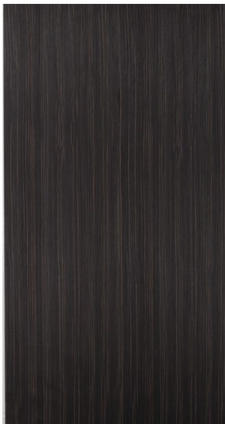
Caramel Ebony FL-Q-5-925