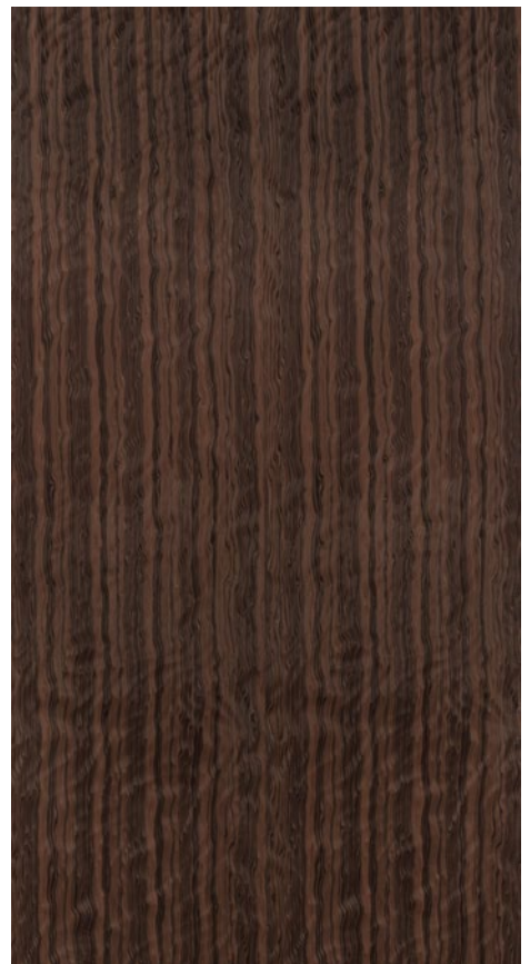
Terra Wave FL-B-P1-564