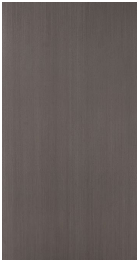
Gray Obechie FL-Q-2-861