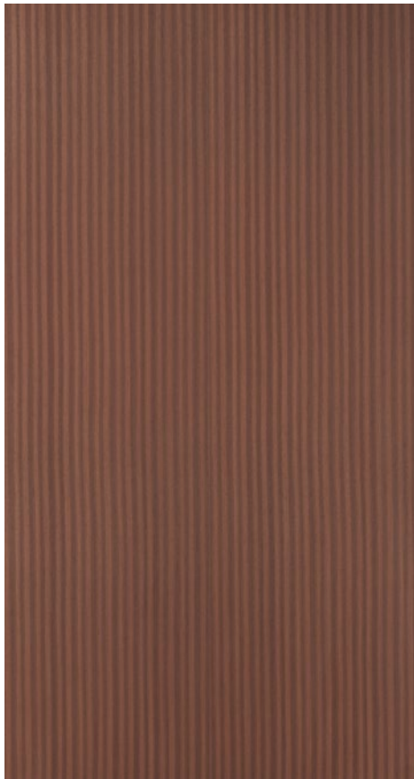
Ribbon Sapele FL-Q-1-631