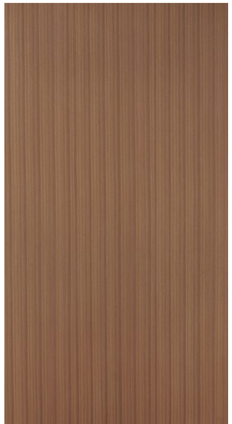
Quartered Teak 2 FL-Q-1-660