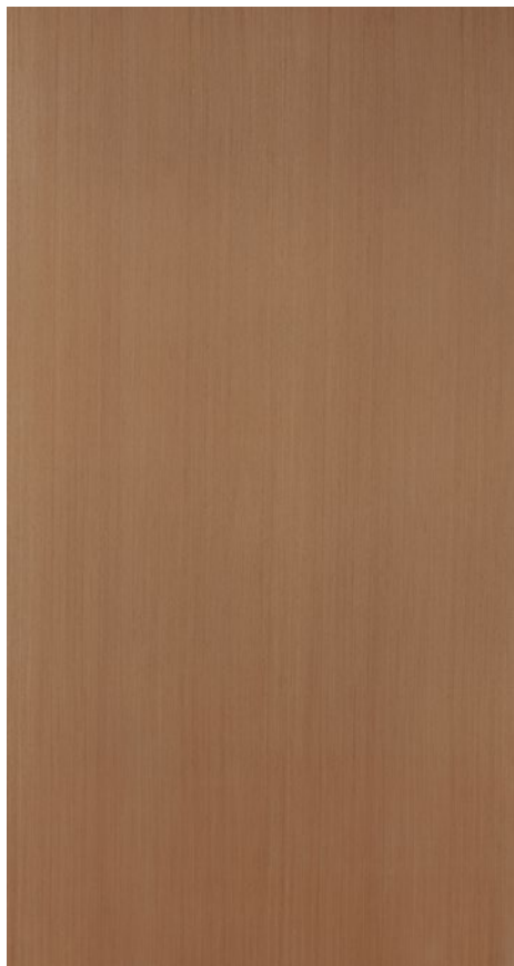
Quartered Teak FL-Q-1-697